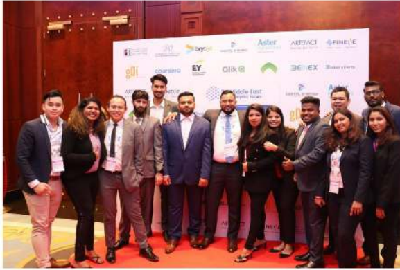
Cogent Solutions event Management team